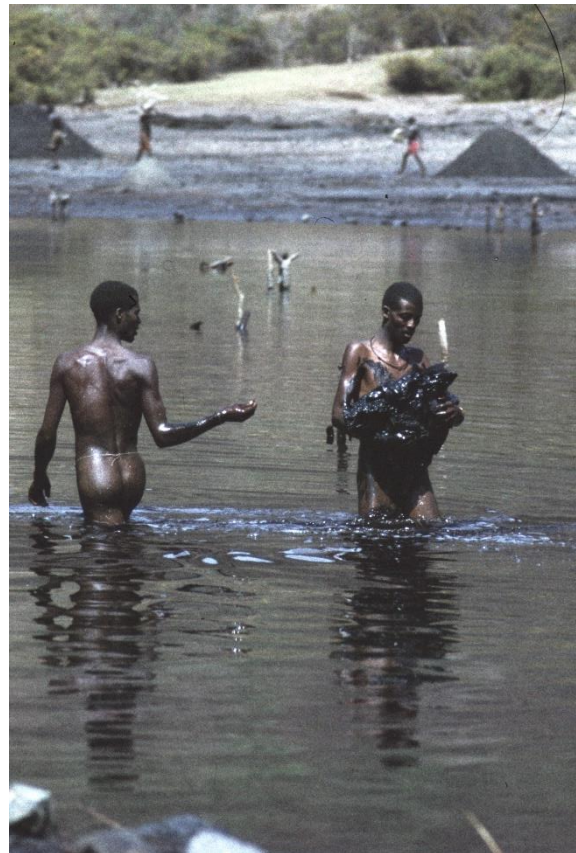
Salt mining in Chew Bet