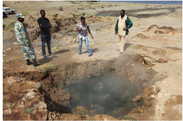
Inventory of hot springs in the Lake Shalla area