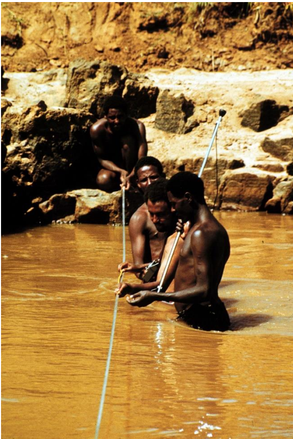
River flow measurements (1982)