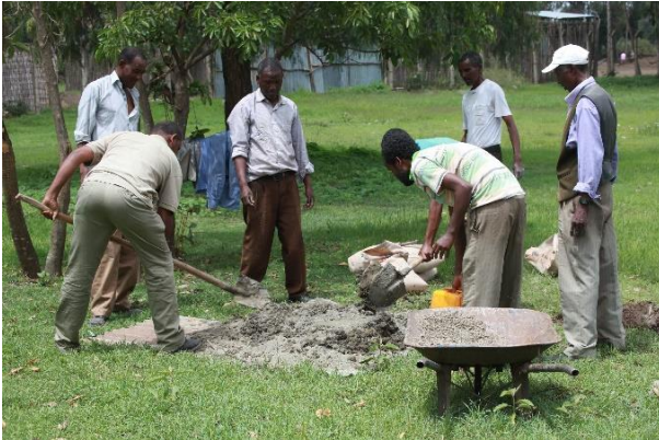
Construction of seismic station in Shashemene