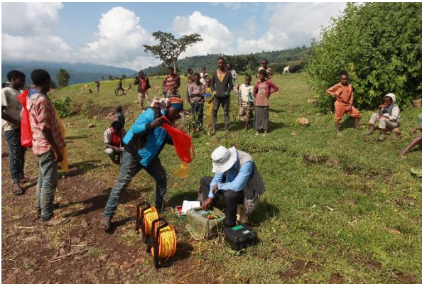
Geophysical exploration for well siting