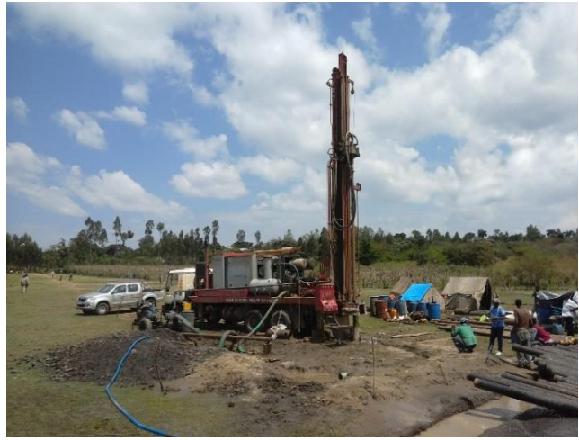
Drilling for drinking water supply project in the Sidama Zone