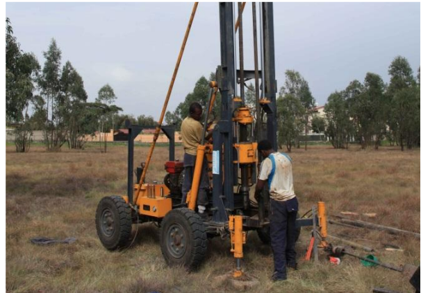
Engineering geology investigation for construction of new Czech embassy in the Kebele 22 area