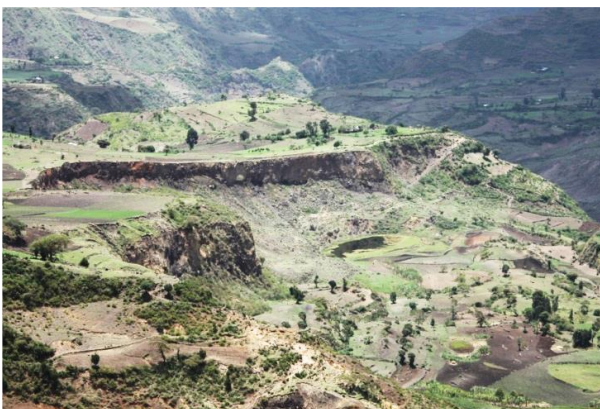
Study of giant lands slides in the Debre Sina area