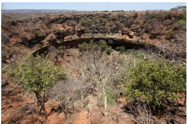
Sink hole near Sof Omar village for database of geo-hazards