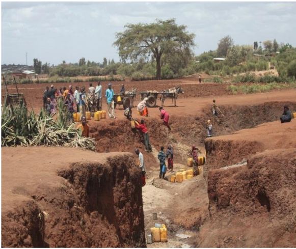
Inventory of local water holes in the Negele area