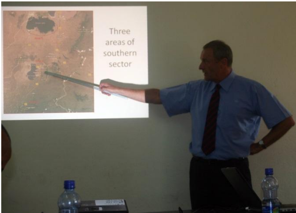
Presentation of study on thermal and mineral waters in the central part of the Rift valley (Addis Ababa University)