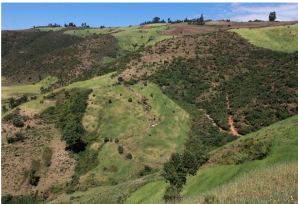
Inventory of springs in the Upper Awash for Addis Ababa hydrogeological map