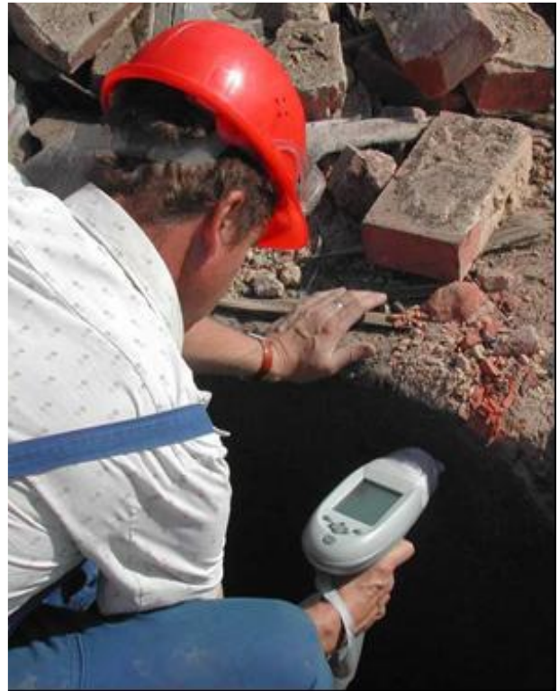
Measurements of masonry pollution in Synthesia company in Usti upon Labe (Czech Republik)