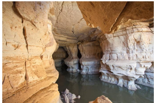
Inventory of Sof Omar karst cave for compilation of Megalo hydrogeological map