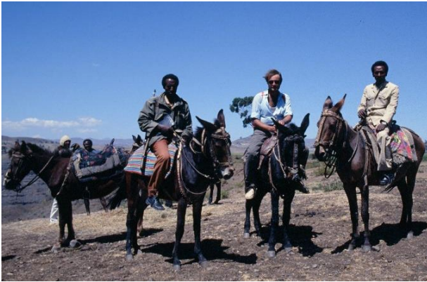
Mapping in the Dessie area (1985)