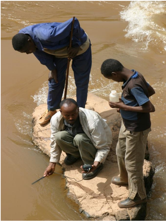
Measurements of physical and chemical characteristics of the Birbir River, Wollega