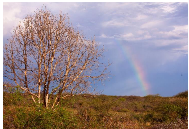
Rainbow in the Welwel area, mapping in the Somali region