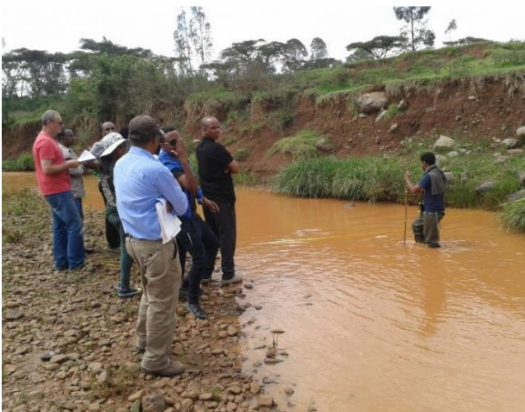
Training in river flow measurements for post-gradual students of Addis Ababa University