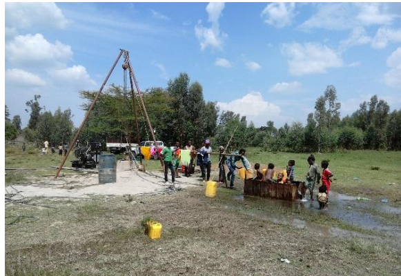
Pumping test in Hantete, Loka Abaya