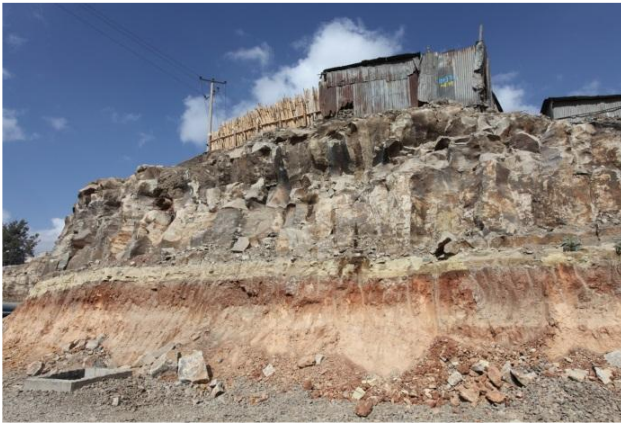
Engineering geology of the Addis Ababa Sheet (ignimbrite and paleo-soil at Debre Zeit road)