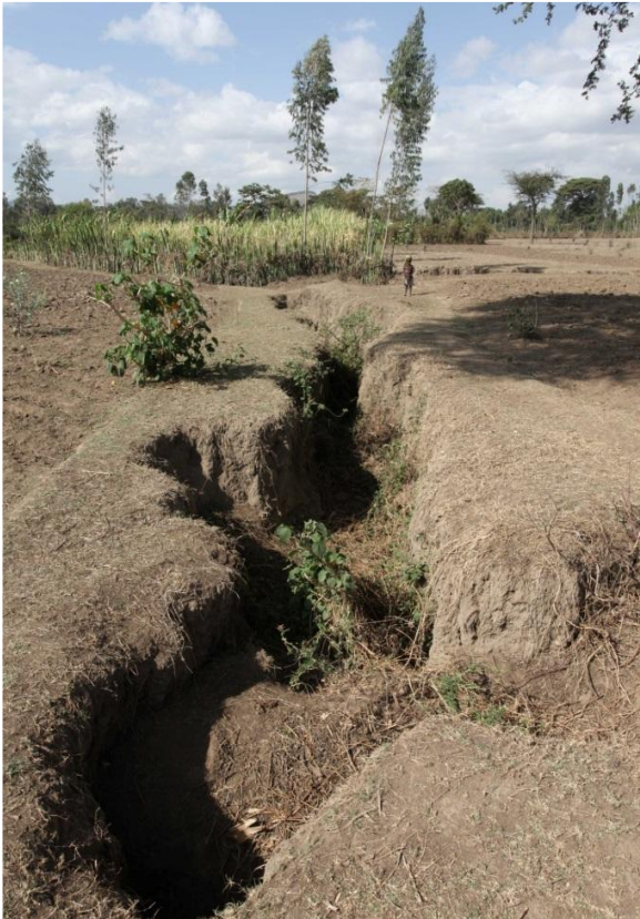
Documenting ground cracks in the Hawassa area geo-hazard map (sub-sheet 0738-C4 )