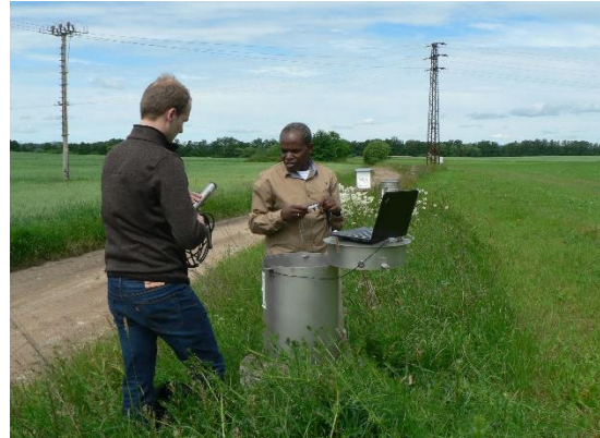
Training in groundwater monitoring near Budweiser, Czech Republic