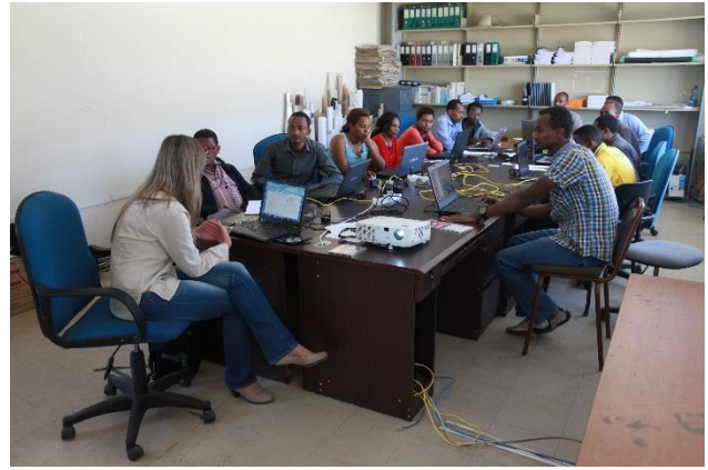
Workshop in remote sensing in Geological Survey of Ethiopia (Landsat/ENVI SW)